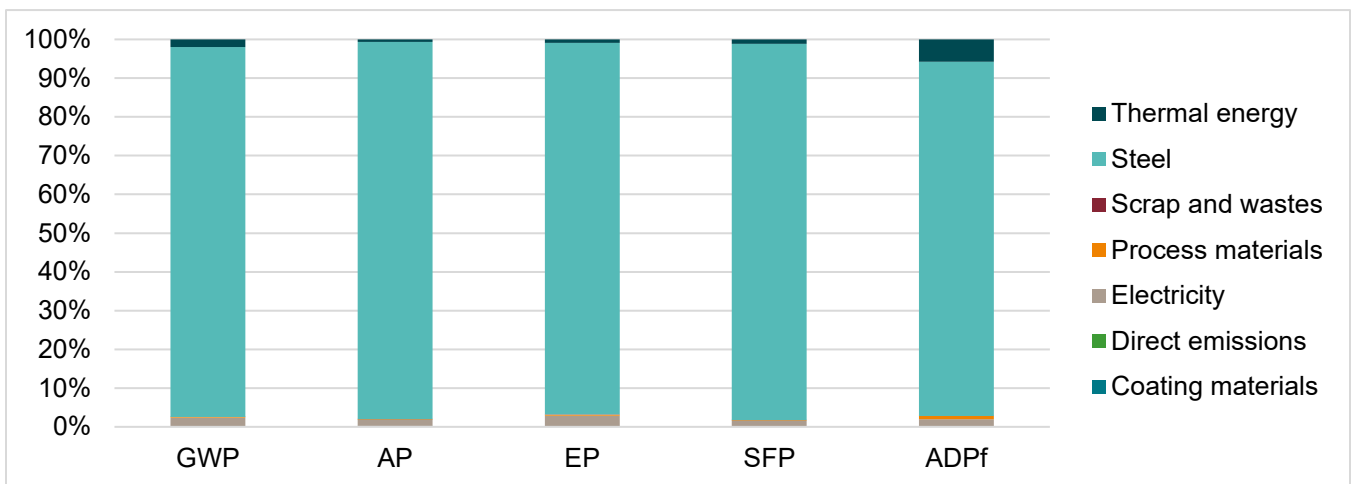
Figure 2: Relative contribution by manufacturing component for 1 metric ton of unfabricated HSS

To better understand sources of potential environmental impacts in Maruichi Leavitt’s HSS manufacturing process, Figure 2 presents relative results for HSS manufacturing (A1 only). Potential environmental impacts for HSS manufacturing are dominated by upstream burdens of steelmaking.